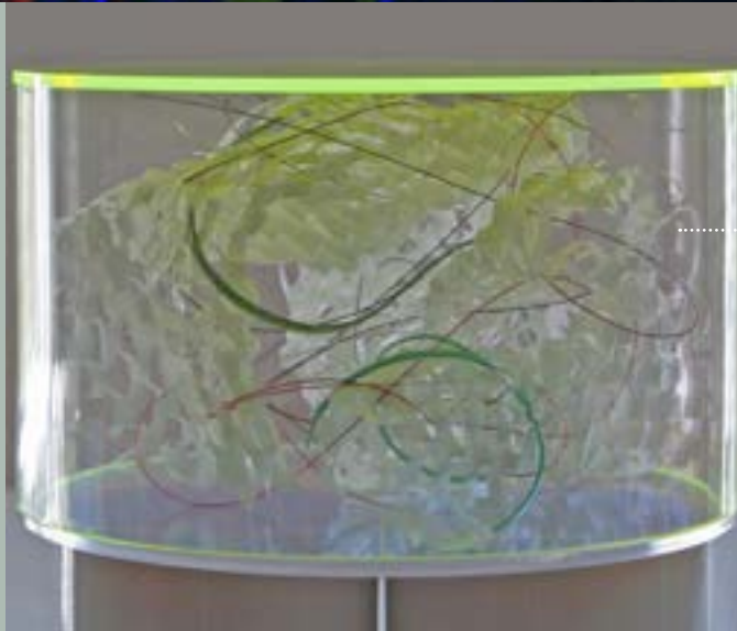
Olga Alexander Synaptic Incubations of Another Kind , 2013–present Mixed media, 3.5 x 4 x 3.5 inches