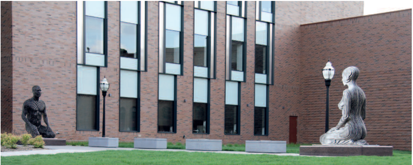
"Spannungsfeld" 10' X 70' X 6', stainless steel and granite, 2014